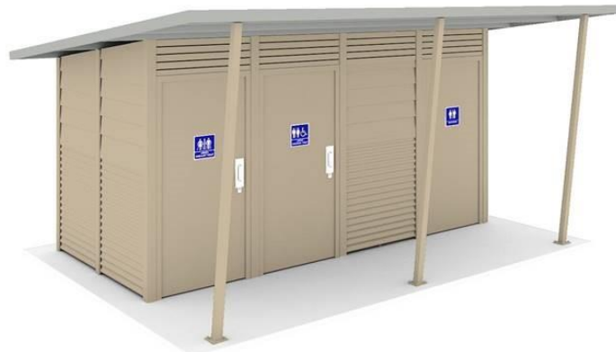
Option 1 - Matching Henry Lawson Oval

Council has compiled three (3) different design proposals for the amenities replacement which are outlined below: