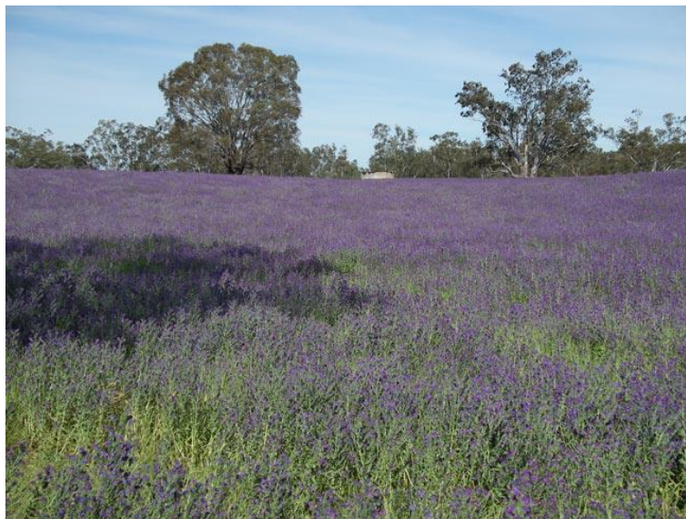
Paterson's curse infestation (Department of Primary Industries 2006)

Residents would have noticed the recent growth of Paterson's curse ( Echium plantagineum ) within the Shire area.