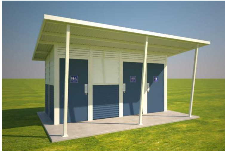
Option 3 - Random Design