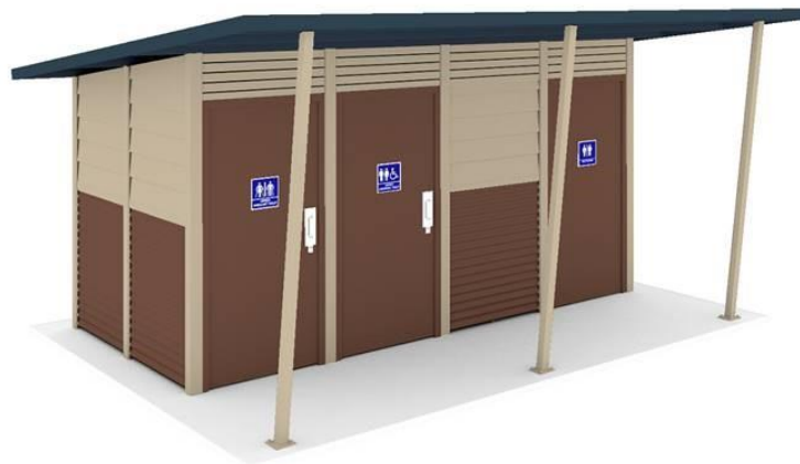
Option 2 - Matching Taylor Park