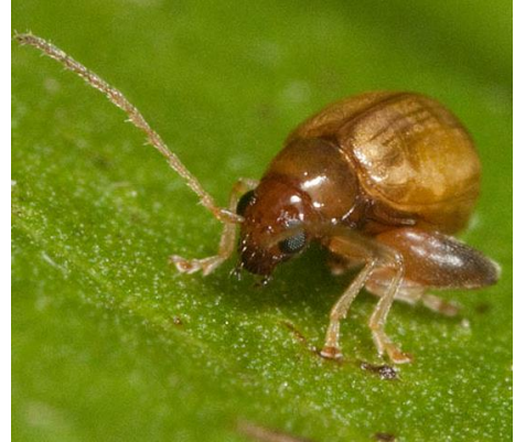
Flea beetle ( Longitarsus echii )

Adults of the flea beetle (Department of Primary Industries 2006)