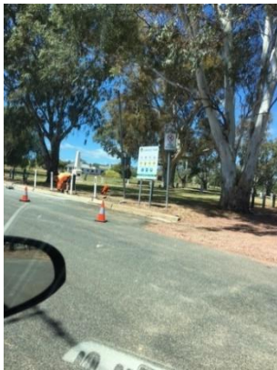
Lawson Park (photo)