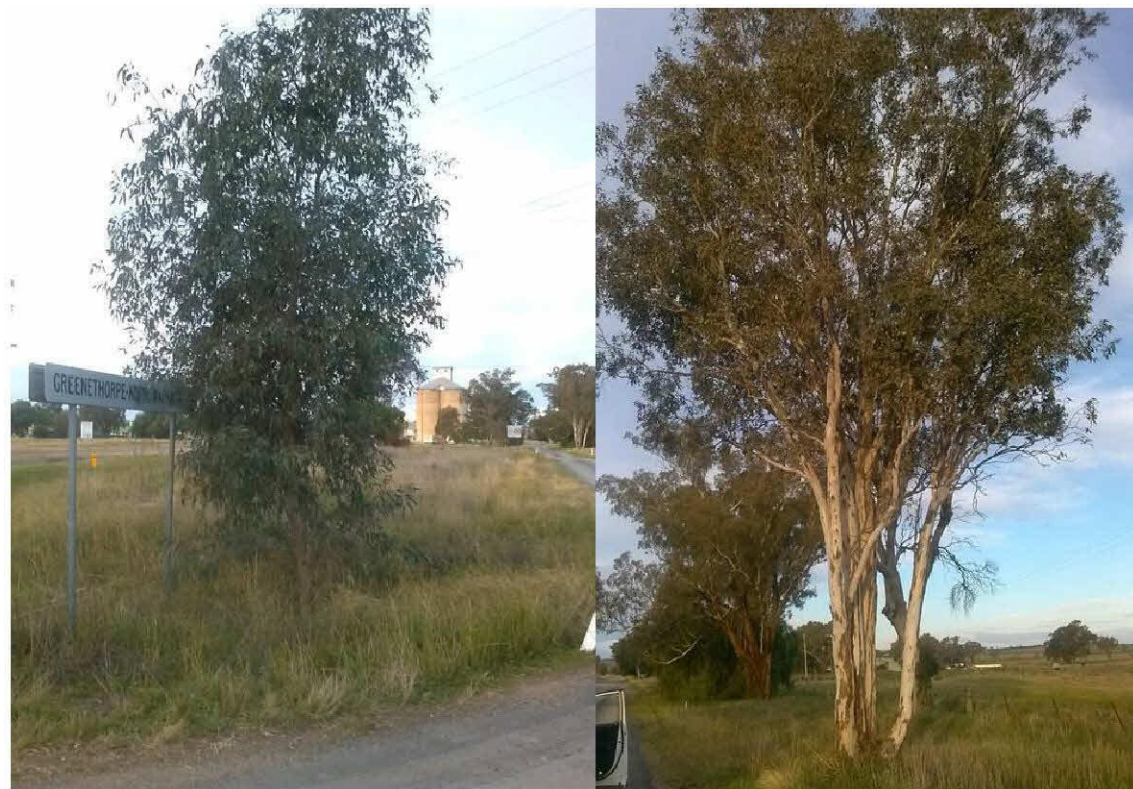
Figures D and E — Examples of trees to be removed

RECOMMENDATION: that Council remove the 7 suckers and trees required, and trim the 5 limbs required.