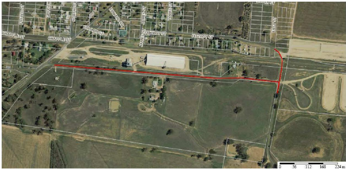
Figure C - Greenethorpe-Bumbaldry Road Upgrade segment 1