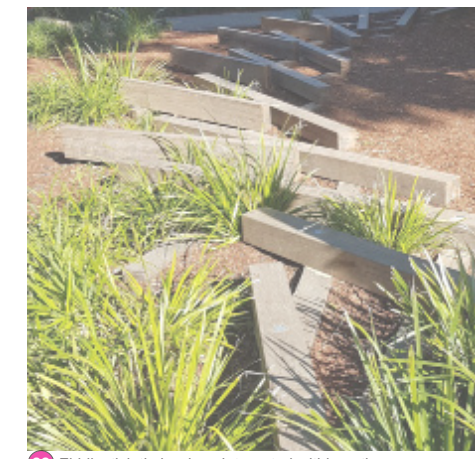
22 Fiddlestick timber logs integrated within native grass