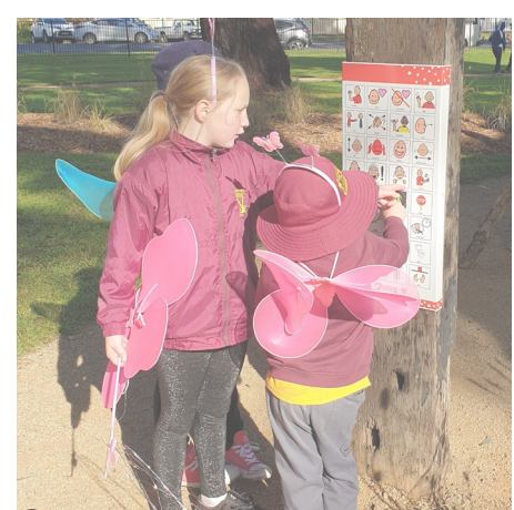
21 Strong use of symbols in signage to assist communication for all.