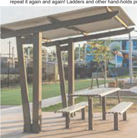
opportunity for everyone to stay longer and enjoy the park.