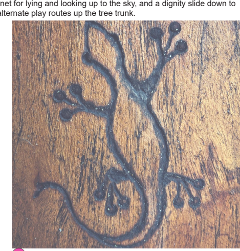
20 Engraving of the goanna into timber elements provides