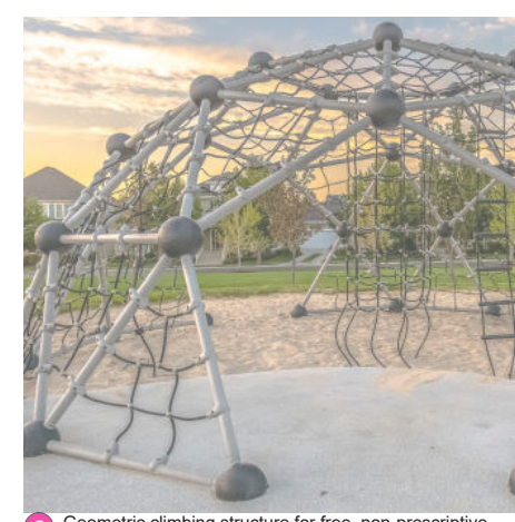
Geometric climbing structure for free, non-prescriptive play.