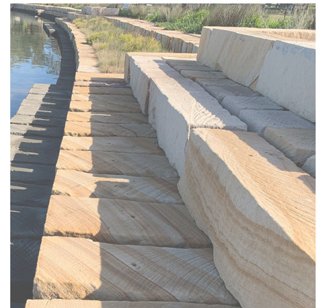
Stacking of sandstone blocks for youth perching and seating from a vantage point.