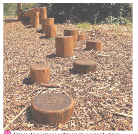
23 Timber stepper logs used to create a network of play paths through the existing garden beds.