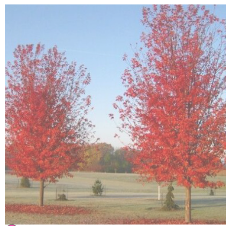
Planting of ornamental shade trees within grass and garden beds provide important shade and seasonal colour.