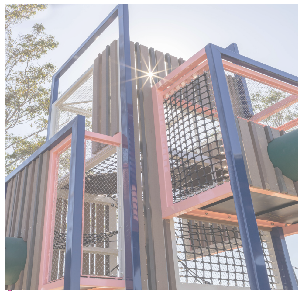
13 Lizard Lookout provides a custom made play element within a sculptural tree trunk, which references the habitat of the Goanna. An internal ramp offers an exciting journey for all to the lookout, a net for lying and looking up to the sky, and a dignity slide down to