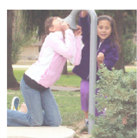
24 Talk tubes set within the garden beds offer sensory and interactive play value.