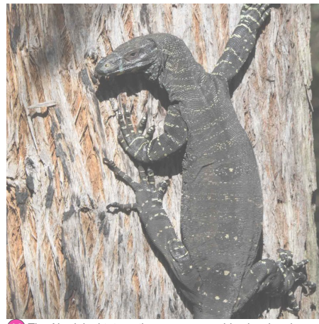
The Aboriginal totem, the goanna, provides local and cultural design inspiration and context.