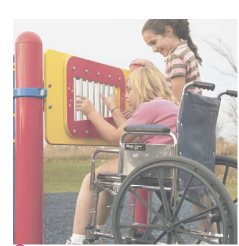
12 Bright, colourful musical play equipment provides fun for all.