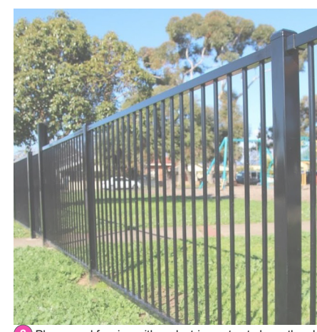
2 Playground fencing with pedestrian gates to keep the play area enclosed and secure for parents and carers.