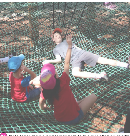
15 Nets for lounging and looking up to the sky offer an exciting underneath perspective and play experience in the lookout.