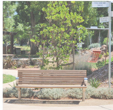
11 Regular seating around the playspace and park provide comfort for all users.