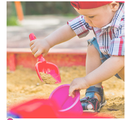
Toddler zone with small sand pit and mound provides quiet play for little people.