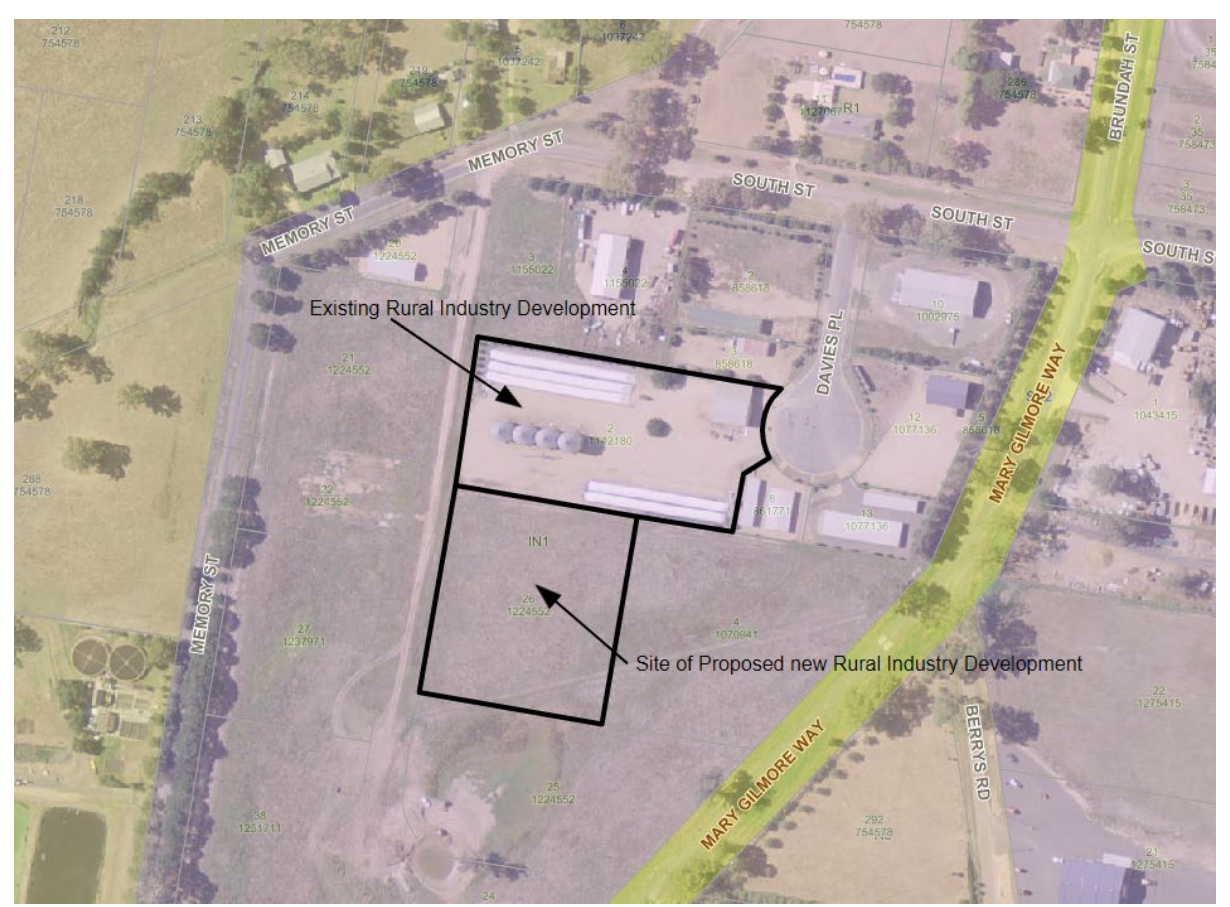
Figure 1. Locality Plan

Lot 26 DP 1224552 has an area of 9886.84m<sup>2</sup> and Lot 2 DP 1142180 has an area of 11076.3m<sup>2</sup>, giving a total combined area of 20963.14m<sup>2</sup>. Lot 2 contains an existing storage shed and existing grain silos, while Lot 26 is vacant. The site has vehicular access from both Davies Place and Phil Aston Place. An overhead power line and associated easement affects both the allotments.